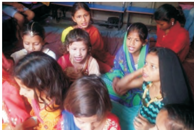
Glimpses of recreational camp at Bal Shiksha Kendra, Nagla Haweli