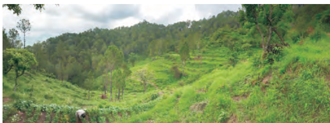
Site of activity: village Padahan, Sirmour District, HP

In the picturesque terrain surrounded by pine covered hilly forests is ensconced the village of Padahan in Sirmour District of Himachal Pradesh.